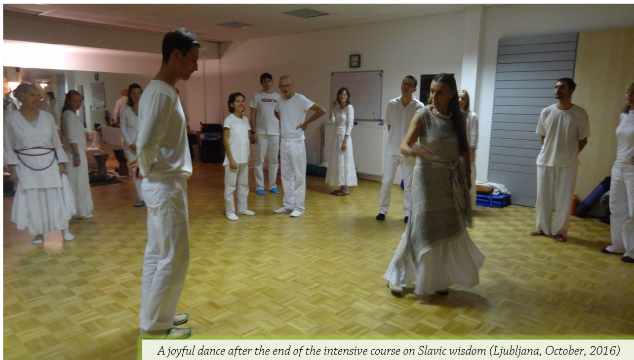
A joyful dance after the end of the intensive course on Slavic wisdom (Ljubljana, October, 2016)

attract into our everyday life similar pain and destructiveness. Set yourself free from rigidity and an ever greater need for possessing huge amounts of information, which has unfortunately become the core of our education system. All of this is unnecessary and not at all related to life. Young people are standing against this.