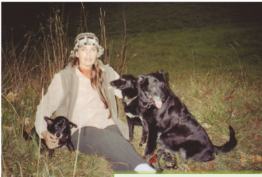
With rescued abandoned dogs in a forest (2007)

My life story is the story of a human being and seeker of happiness, who was at first, primarily due to necessary learning, withering as a consequence of sorrow and anxiety, unhappy emotions and despair. But, through an awakened awareness of the human's concealed capabilities, I managed to rise above those problems, to move beyond disease and to surmount the devastating forces of my destructive emotions and thoughts. It is