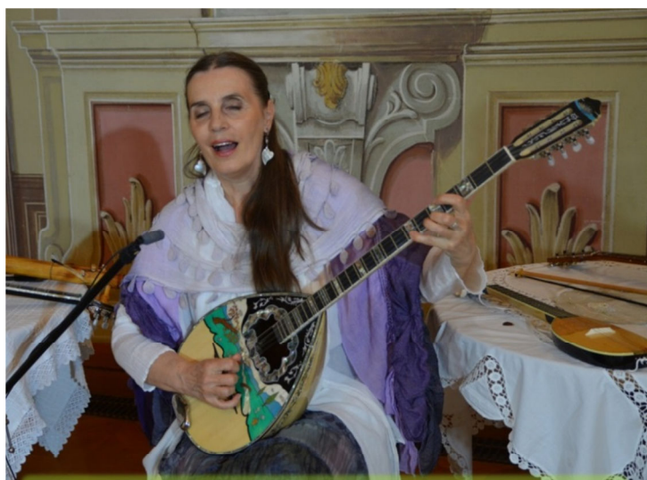
When the free sensuality of Gypsy melodies overwhelms you. Recording the bouzouki CDs at the Cekin Mansion (May 2014)

The answer is extremely simple: the purpose of life reveals itself through spiritual growth and through the transformation of spiritually unloving and destructive thoughts, emotions and reactions into a loving, awakened co-existence, in which people both comprehend and live within all levels, or dimensions, of existence – the earthly, spiritual and cosmic (primordial) alike, within the totality or completeness of life on Earth, within Triunity, Unity – within nine different (frequency) worlds of reality, as folk tradition puts it. We build this only by being mindful and awake, by turning confusion into harmony. We should follow ever higher, ever broader life ideals. In order to establish