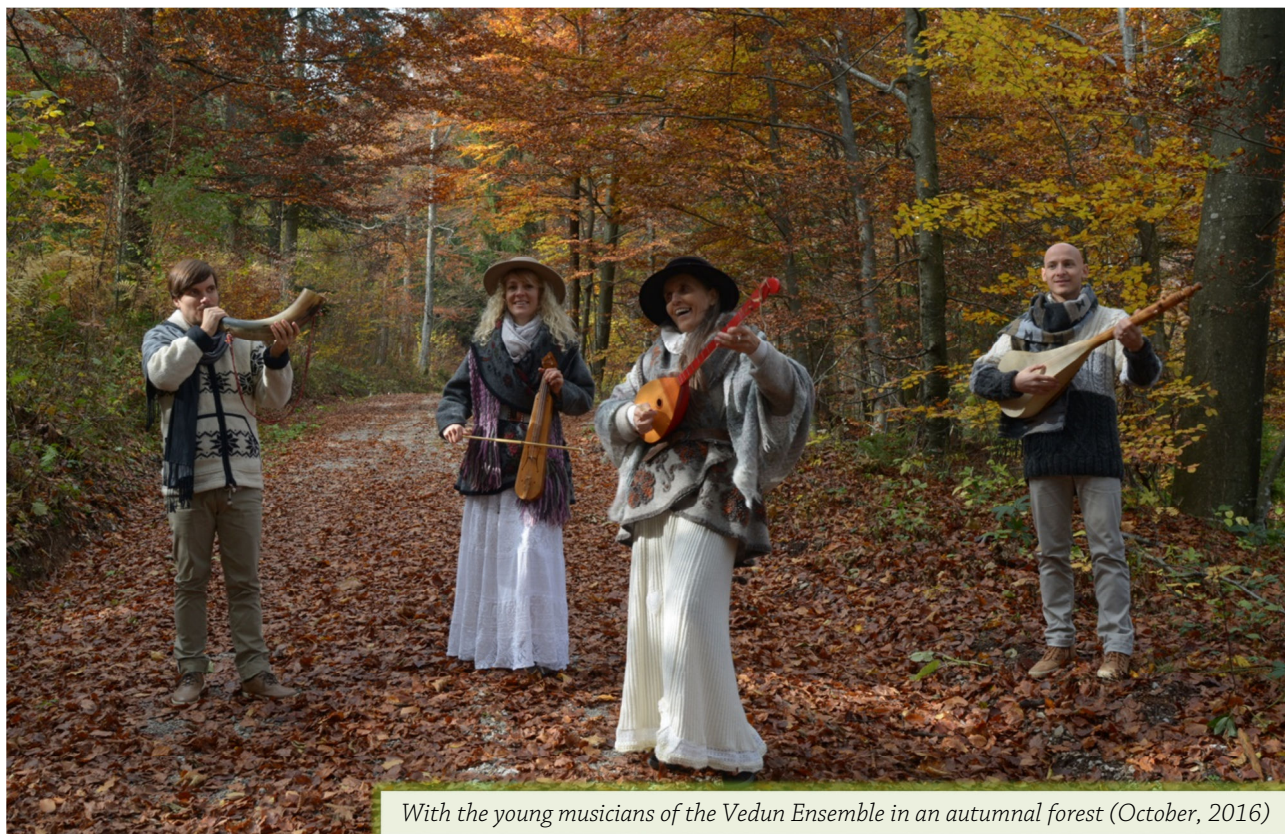
With the young musicians of the Vedun Ensemble in an autumnal forest (October, 2016)