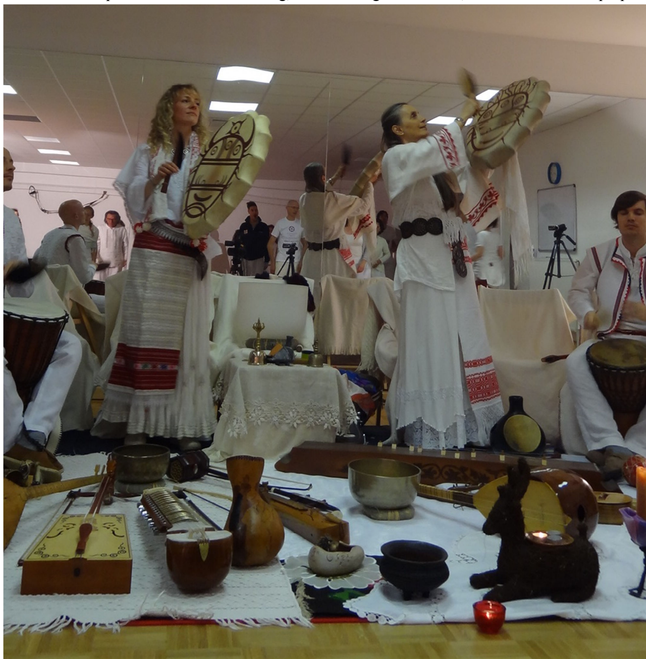
Reviving the Slavic and ancient Slovene cultural and musical heritages; wearing Macedonian clothing (Ljubljana, 2015)

The passage beyond a divided conflicting life, also called the vale of tears, beyond threat and darkness, can happen when our consciousness is broad enough, when our insights are subtle and clear enough, when our thoughts and emotions are cleansed, when our heart is open enough and when our actions are dedicated to serving the planet and others – without mere profit-oriented demands and expectations. With awakening, with an enlightened mind, we come to see the purpose