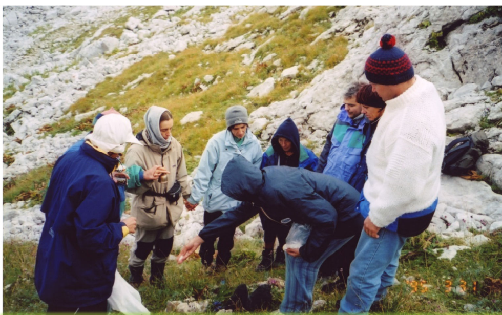
Opening the cosmic-earthly portal for Slovenia on the sacred mountain Krn (September, 2004)

It happened on the last Sunday of February 1993; this was the year of my hardest trials, yet at the same time, the year of my most intense spiritual quests and learnings. My partner, two friends and I had set off on a ride across rough terrain. On our way back, this particular horse suddenly stopped at the junction where we usually turned left, but on this occasion we had decided to take the opposite direction. The horse threw my husband from the saddle. He flew over the horse’s head and landed, on his back, on sandy ground scattered with rocks. This was followed by my fall, which was actually a somersault over the head of my horse. At that very moment, I had the feeling that I was watching two films in slow motion: I saw my husband’s body fall to the ground in slow motion, but at the same time, as an outside observer, I watched myself and the film of my life. As I was falling, I felt an energy touch below my body, as if hands were holding me, putting me safely on the ground. Everything unfolded somehow outside the dimensions of time and space. Within two or three seconds, the films of my husband’s life and mine unrolled within me, but at the same time, there was a distinct awareness of the current moment.