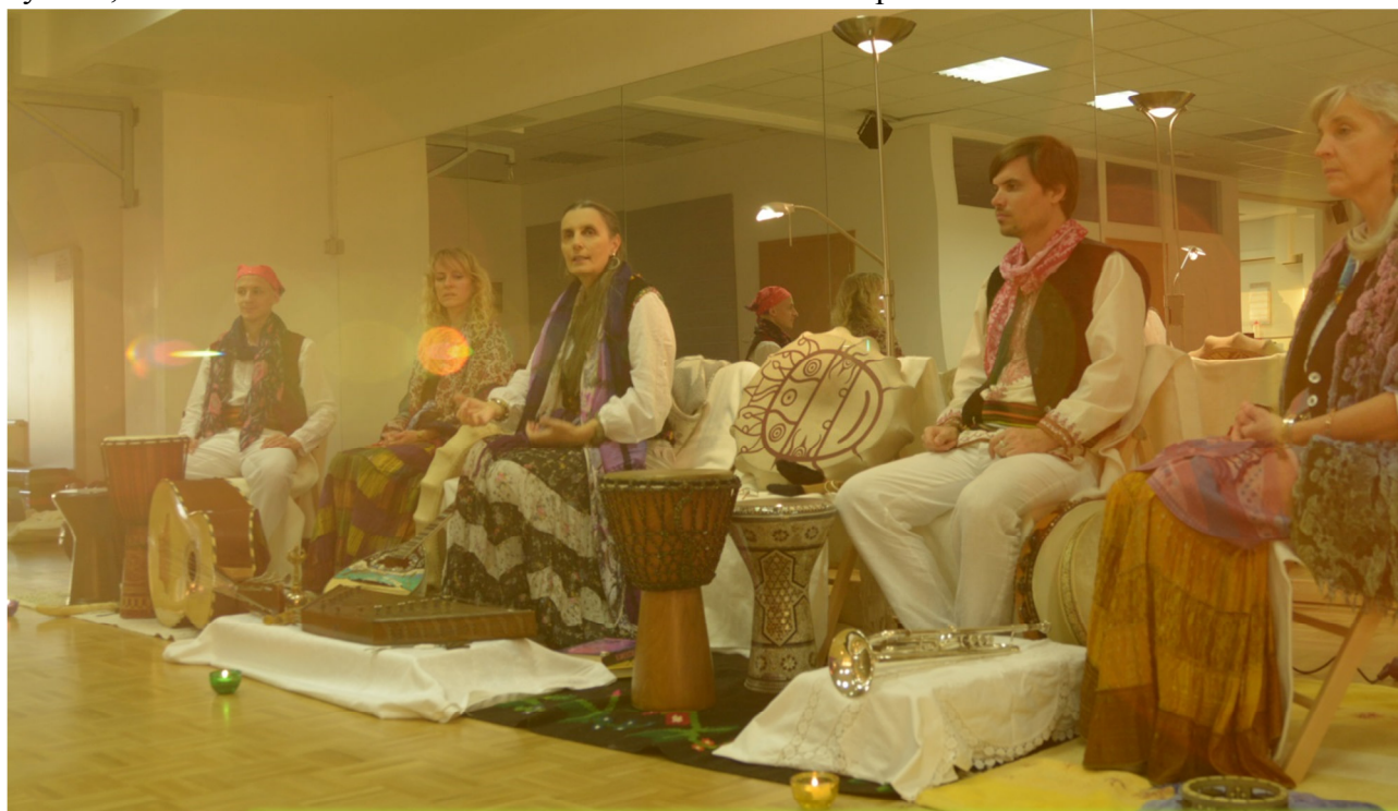
The magic and play of light at the course on Gypsy culture (MaxxFit Centre, Ljubljana, November 2016)