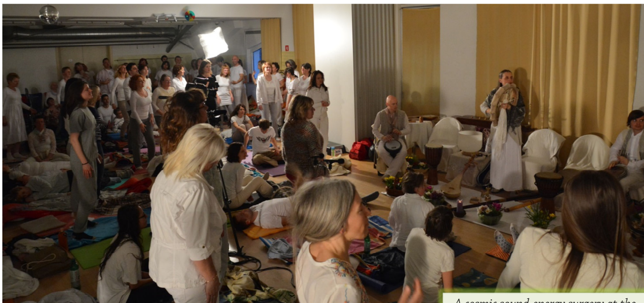
A cosmic sound-energy surgery at the Veduna-Sensa Day (2014)

neighbouring countries (the disaster-hit regions in Bosnia, for example) and elsewhere in the world. Wherever I go – I rescue animals. When in dire, people often forget about them. And of course we help refugees.