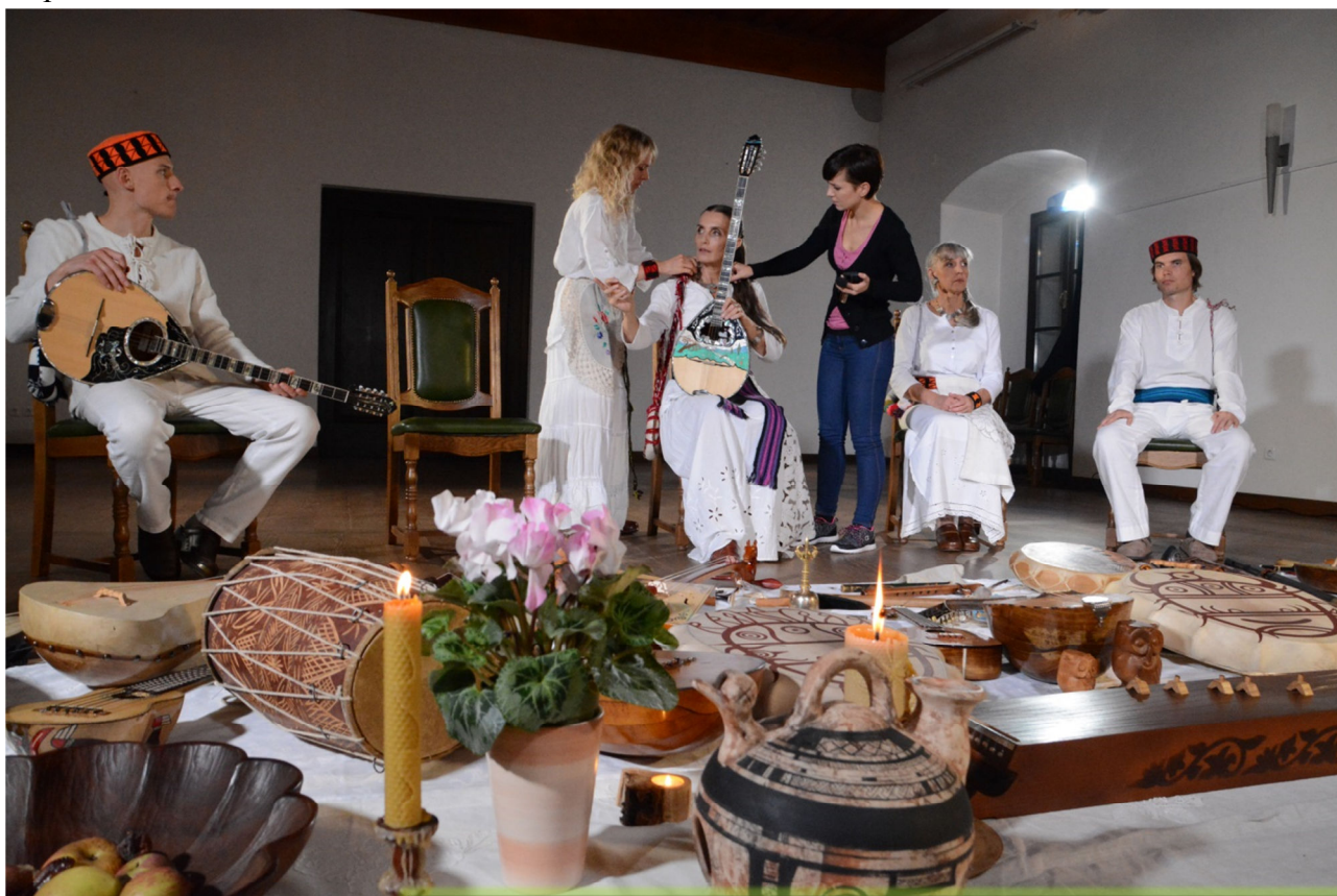
The Vedun Ensemble musicians in makeup before filming (Turjak castle, October 2015)