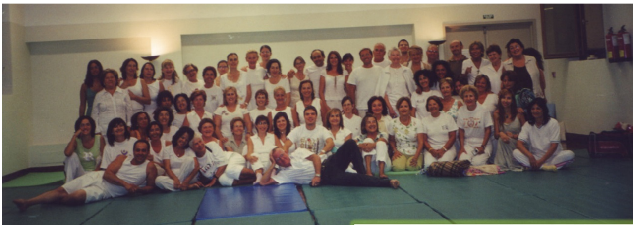
Spanish students of the Veduna School (Malaga, 2006)

At the age of twelve, still in childhood, you had already experienced your first spontaneous spiritual initiation, an age which is extremely important in different shamanic traditions.