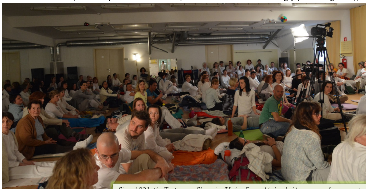
Since 1991, the Trutamora Slovenica/Vedun Ensemble has held numerous free concerts and sound-energy surgeries (Buba Centre/Ljubljana, Veduna-Sensa Day, 2014)