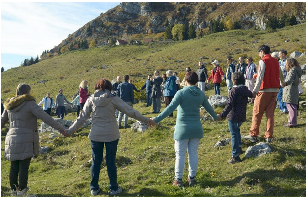
Energy maintenance and opening a cosmic bridge at the Krn megalithic circle (October, 2016)

Of everything that was happening. When I landed on the ground, I intuitively placed my hands, without any questions, on my husband's coccyx. In an instant of absolutely clear insight, I just knew I had to put my hands precisely there.