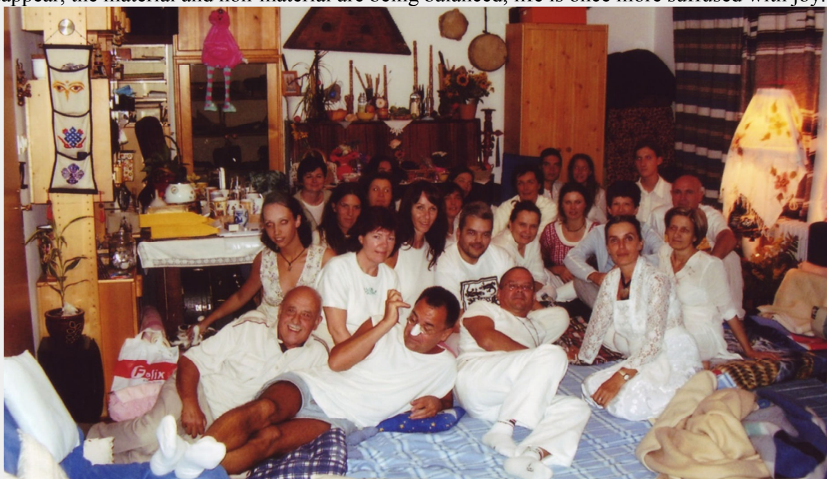
Veduna School students beneath Kurešček hill (2007)

My cosmic–earthly ‘surgery’ path is a path, which uses energy and the power of sound. Having been encouraged by Filipino cosmic surgeons, I discovered that I would obviously have to develop and revive a ‘bloodless’ sound surgery tool. This is how, for many years, with the help of sound vibrations and entities, I have been successfully ‘operating on blockages’ and imbalances in etheric and non-material bodies. Following an operation, a new balance is slowly transmitted to the physical body. Participants also release their problems and the chaos within them through shouting and crying. The effects are surprising: people feel renewed, lumps and even cancer formations disappear, the material and non-material are being balanced, life is once more suffused with joy.