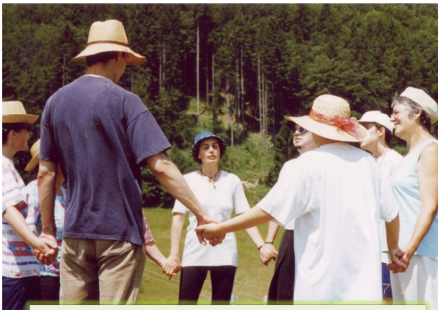
A ceremony at the "Tibet of Sorica" beneath Mount Ratitovec (Spring, 2004)